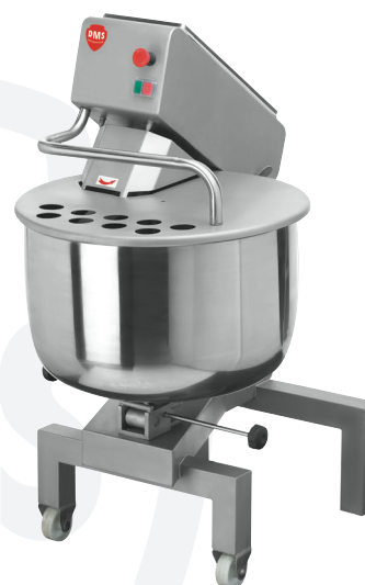
Fig. DMM 90 V

Also available without the separate bowl motor as DMM 60 V or as bigger versions DMM 90 VM or DMM 90 V.